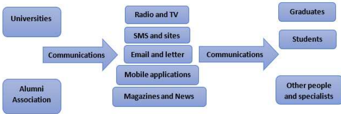
Figure 2. Innovation in the relationship between graduates and the university

satisfaction (Rattanamethawong et al. , 2015).