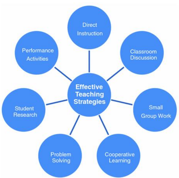
Figure 1 Inclusive teaching method

In the past decades, comprehensive teaching was also proposed in front of the teacher-centered method (Figure 1).